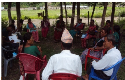
Members engaged in discussion during Bimonthly meeting in Achham