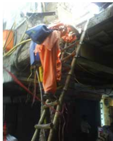
A Nepali woman climbing down from her residence in Delhi

“ In all these years you people are the only one who came to enquire about our well-being. The rest all come either to frighten or to harass us.”