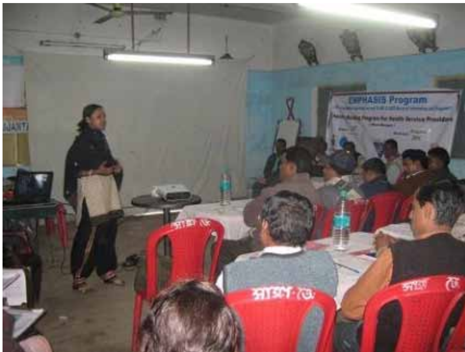
A woman living with HIV shares her experiences with service providers

The EMPHASIS team in India organized a capacity building program for 18 local health service providers in West Bengal on 24th December 2010. The program dealt with topics on epidemiological issues of HIV and AIDS along with STI management, Syndromic approach, ethics, confidentiality, counseling techniques,