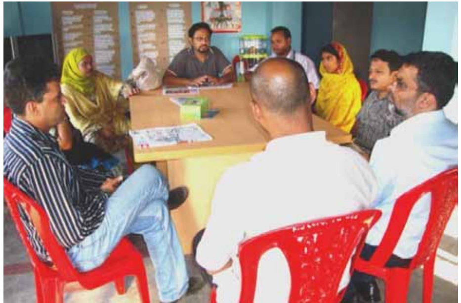
EMPHASIS India Team is discussing with staff of Bhomra DIC

The meeting resulted in documenting the following: