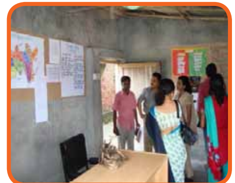
EMPHASIS India team and Regional Secretariat staff visit Chanduria Community resource center.