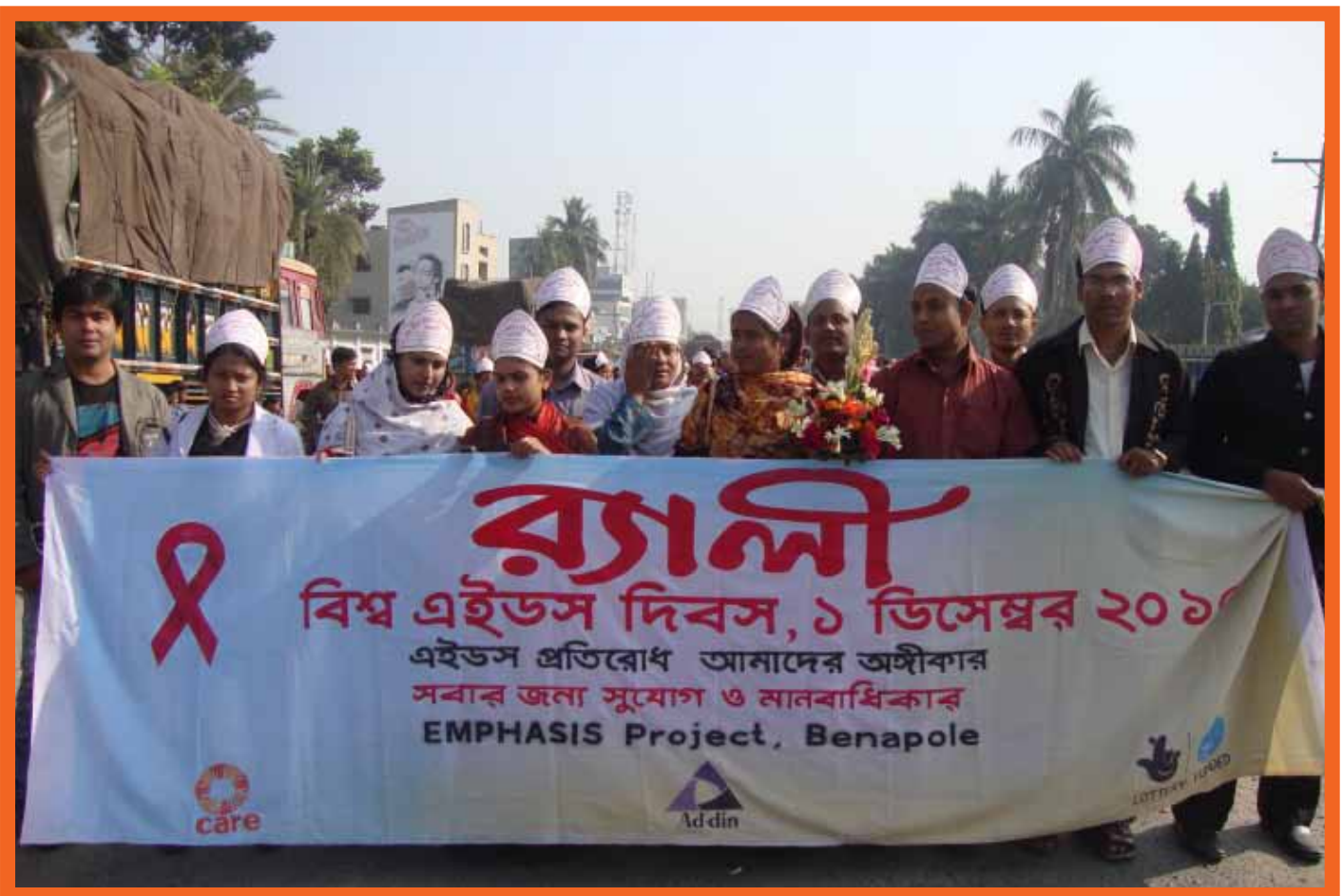
"EMPHASIS taking part in a rally to celebrate World AIDS Day 1 Dec 2010, Bangladesh