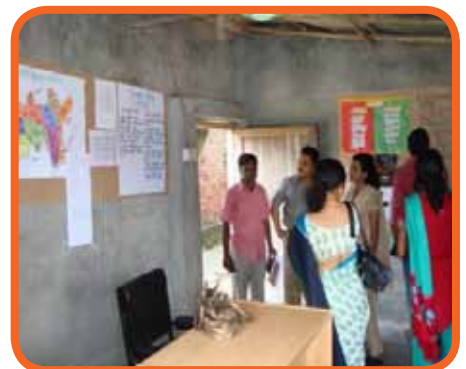
Community Resource Center, Chanduria, Bangladesh