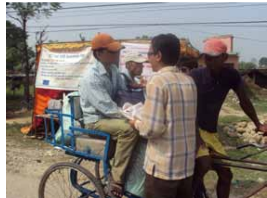
Samajik Samanata Aviayan (SSA) Sub grantee (Nepal) staff giving HIV related information to returnee from India

The Mass Awareness Program was successful in reaching approximately 7,000 people with HIV awareness message.