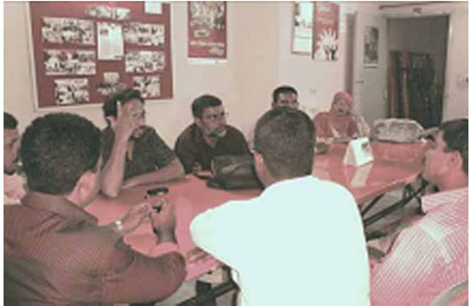
Discussion through SALT method with people living with HIV at GHF

dreams of participants and their families and also brought out individual strengths of participants. Among the different dreams shared, one stands out. A young girl was initially hesitant to share her dream of becoming a doctor. She stated that even if she shared her dream she knew it could never be a reality, because she could not afford it. The facilitator assisted her and her parents in a costing and timeline exercise for this dream. Accordingly, the total money required was about four or five hundred thousand Taka. The mother of the girl pointed out how she could earn money from her skills, the profit of which after a year was enough to get a battery-powered rickshaw that runs in the town. Thus, from the earnings of this rickshaw in the same number of years she would be able to complete a degree.