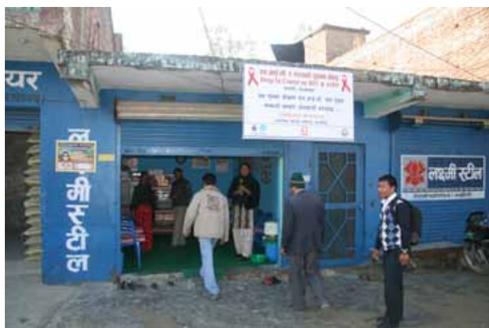
A Drop-in-Center for mobile population in transit to and returning from India.

Staffed mainly by local facilitators and volunteers together with two to three Outreach Workers, the centers are meeting places where mobile populations can visit and get information on topics related to HIV prevention, proper user of condom, and counseling services when travelling to their destination or coming back home. The centers also mobilize a number of Peer Educators who visit the mobile population and provide health education, referral/linkages services.