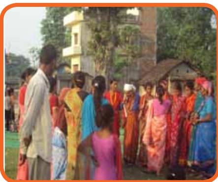
Mass Awareness Program in Dhangadi, Nepal

In addition to Delhi and Kolkata, Mumbai has been added to EMPHASIS project sites. In the project's first year we saw a significant number of Nepali and Bangladeshi mobile population go to Mumbai for work. An initial mapping of the mobile population has been completed and the selection of a local sub grantee is underway to begin implementation of services to the mobile populations from Nepal and Bangladesh.