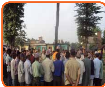
Mass Awareness Program in Dhangadi, Nepal